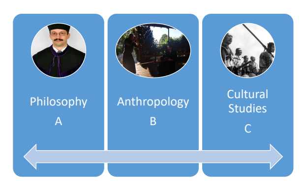
Fig. 3. Transdisciplinarity – Discipline B is extended to adjacent disciplines A and C, with B serving as the base concept.

Why are interdisciplinary, multidisciplinary, or transdisciplinary approaches more advantageous for discovering new knowledge? Are these concepts synonymous? Let us try to explain and illustrate them using very simple diagrams.