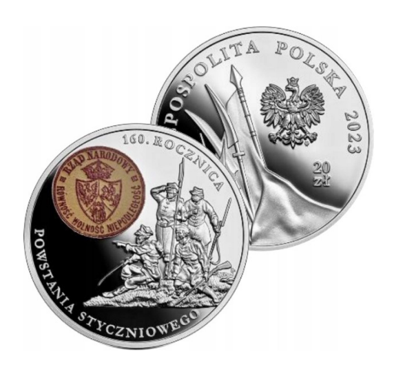
Fig. 3 . 20 zloty coin "160th Anniversary of the January Uprising," Ag 925, 28.28 g, National Bank of Poland, 2013. Issued on January 16, 2023.

From the shared heritage of the First Polish Republic and the Cossack tradition, Ukrainians draw strength today as they bravely and effectively defend themselves against Russian imperialism. Obviously, both Slavic countries, namely Poland and Ukraine, cherish the legacy of the Vistulan and Polan State (8th-9th century) and the Kievan Rus (9th century). Previously, they shared ancient history, poorly explored, of Aryan-Slavic/Indo-European origins. Thus, Ukrainians are fighting today like their brave ancestors, their brave ancestors, striving for the freedom and sovereignty of their state.