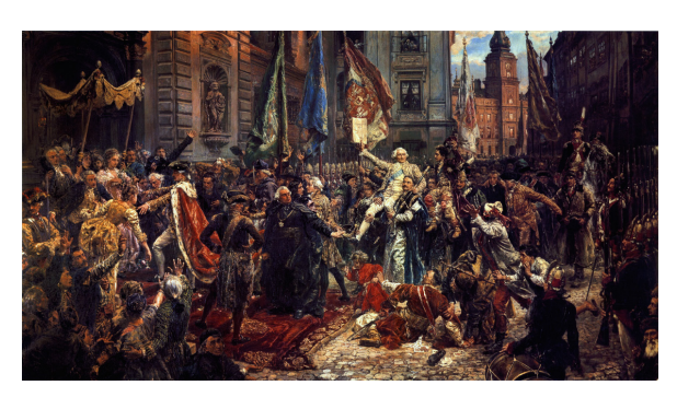
Fig. 1. Constitution of May 3, 1791 [painting by Jan Matejko, 1891].

White Eagle holds a sword and a cross, while the Knight in the Chase and St. Michael have crosses on their shields. The role of religion, especially the Catholic Church, in preserving Polish identity and later regaining independence cannot be overstated [Cynarski 2022]. The coat of arms on the seal of the National Government is featured on a commemorative silver coin of 20 zloty dedicated to the memory of the heroes of that time [Fig. 3], which also displays the primary weapons of that era - a rifle with a bayonet, a war scythe, and a sabre. It is also depicted on a gold coin with a denomination of 200 zloty. The inscription on the seal reads "Equality, Freedom, Independence". At that time, the residents of the territories of the First Polish Republic - Poles, Lithuanians, and Ruthenians - were fighting for these ideals against imperial Russia.