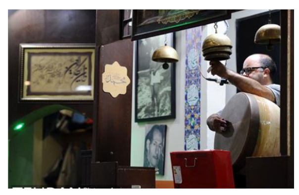
Figure 7. The place of the Morshed and his bells, the Shirafkan Zurkhaneh , 1923; Qajar era, Tehran.

Architecture is a platform for informal learning; Whether in the body of an educational environment or in the context of a cultural and religious setting. The structure and body of the Zurkhaneh indirectly grants advice and morals for its users. By applying signs and symbols, the Zurkhaneh apprises athletes of high moral concepts including "humility, simplicity, seeking the underprivileged, religiosity, attention to tradition, return to principles, order, justice respect for the elders, defending the oppressed and many other merits" [Masoudi et al. 2017: 100]. Furthermore, in a number of the Zurkhanehs of Tehran, wall-paintings in the style of coffee houses are apparent [Moghtadari, Nouri 1976]. Applying such paintings that derive from the stories of the Shahnameh endorse epic and heroic personalities, in actual fact, it is an attempt to provide appropriate models of power and didactic education for all athletes of the Zurkhaneh (Figure 8).