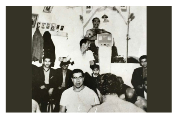
Figure 3. Sardam and the Morshed with his famous bell in Pulad Zurkhaneh of Tehran, 1921, Qajar era, Tehran.

reflect the relics of Sufism and seeks to enhance heroic manifestations of warfare thus swords, shields, armors, helmets, poles, stones, and the dervish belts were often displayed in this area. "The shape and appearance of the Sardam varied in the Zurkhanehs of Tehran as some were made in the form of semicircles, cones, squares and pyramids, or trapezoids" [Moghtadari, Nouri 1976: 51-50] (Figure 3).