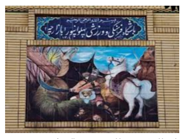
Figure 8. A view of a wall painting in Pahlavanpour Zurkhaneh , built in 1923, Tehran, Qajar era

Architecture is a platform for informal learning; Whether in the body of an educational environment or in the context of a cultural and religious setting. The structure and body of the Zurkhaneh indirectly grants advice and morals for its users. By applying signs and symbols, the Zurkhaneh apprises athletes of high moral concepts including "humility, simplicity, seeking the underprivileged, religiosity, attention to tradition, return to principles, order, justice respect for the elders, defending the oppressed and many other merits" [Masoudi et al. 2017: 100]. Furthermore, in a number of the Zurkhanehs of Tehran, wall-paintings in the style of coffee houses are apparent [Moghtadari, Nouri 1976]. Applying such paintings that derive from the stories of the Shahnameh endorse epic and heroic personalities, in actual fact, it is an attempt to provide appropriate models of power and didactic education for all athletes of the Zurkhaneh (Figure 8).