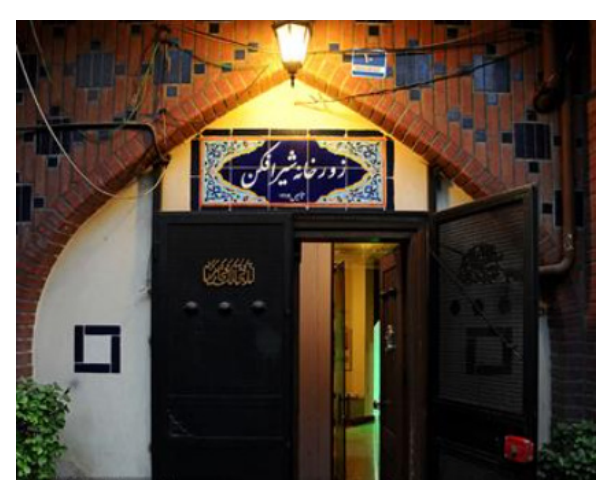
Figure 1. The main entranceway to the Shirafkan Zurkhaneh , 1923; Qajar era, Tehran.

The structure of the Zurkhaneh commences with its entrances. An examination of the architecture of the structure indicates that the building had two entrances. One went out into the alley and the other after passing through a short corridor entered the Zurkhaneh . The first door was tall whilst the second door was shorter for means that athletes bow their heads in front of the Zurkhaneh area before entering [Insafapour 2007]. "The entrance doors of Tehran Zurkhanehs are generally made of wood, glass, iron or stone with a height that is approximately more than two meters or less" [Moghtadari, Nouri 1976: 50-49). An examination on the psychological origins of the Zurkhaneh specifies that didactic purposes are implied in its structure.