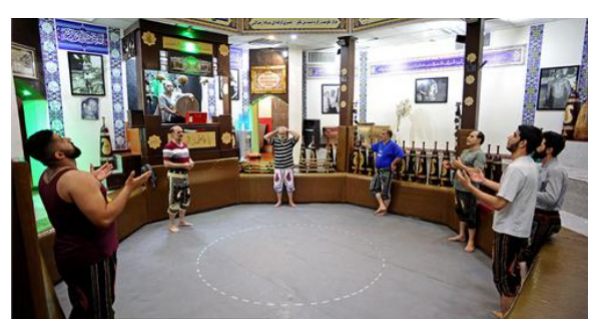
Figure 5. The pit ( Gowd ) of Pahlevanpur Zurkhaneh , built in 1923, Tehran, Qajar era