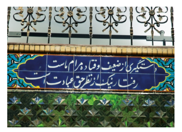
Figure 6. A view of the use of epic and instructive poems in Pahlavanpour Zurkhaneh , built in 1923, Tehran, Qajar era

The reflection of epic and didactic poems in Zurkhanehs played a significant role in providing decent and ethical models. Visual education generated a central part in institutionalizing moralistic principles. Figure 6 is a reflection of this principle in the Pahlavanpour Zurkhaneh in Tehran.