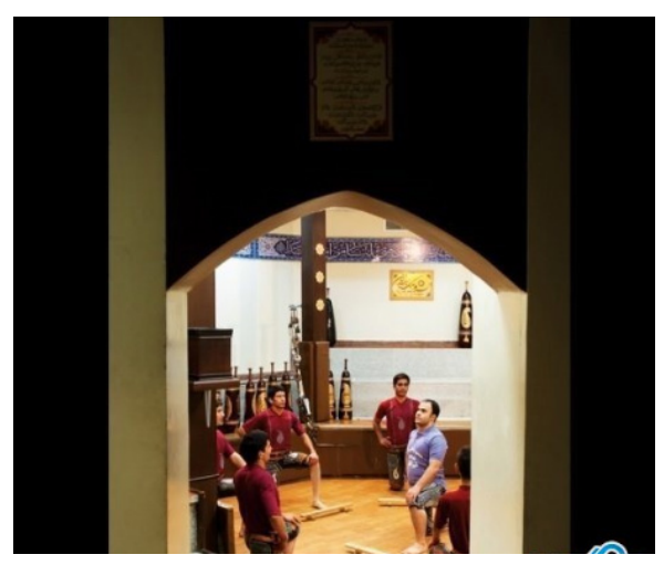
Figure 2. The second entranceway to the Shirafkan Zurkhaneh , 1923; Qajar era, Tehran.

forcing everyone to bow in respect while entering. At the center of the room lay the pit ( Gowd ), a hexagonal sunken area about one meter deep in which rituals took place. The style and overall appearance of the doors of Qajar Zurkhanehs have roots in the history of ancient Iranian temples, essentially, deliberately or instinctively they convey a kind of moral edification as those who enter must bow their heads and this indicates modesty and humility upon their arrival to the Zurkhaneh (Figure 2).