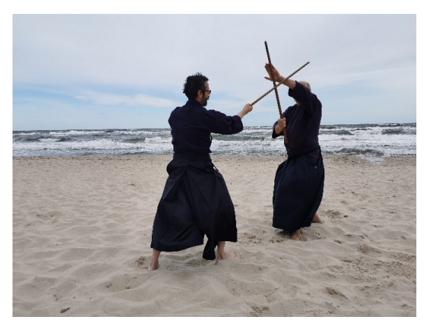
Photo 5. Kenjutsu practice. A fragment of Haka-no tachi.

Tokyo, Japan (6-12.09.2021) – 54 <sup>th</sup> Annual Conference of the Japanese Academy of Budo . The Academy's headquarters are located inside the Nippon Budokan.