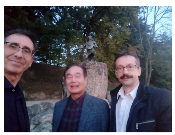
Photo 10. At the monument of the Iberian Chief Viriato – once again presidium of IMACSSS. Viseu, October 2019.

Visits to Viseu, Porto, and Lisbon were already implemented outside the conference program. We see