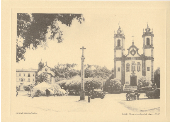
Fig. 1-2. Old, Catholic Viseu. Camara municipal de Viseu , Tipografia Beira Alta , 1999 and 2002.