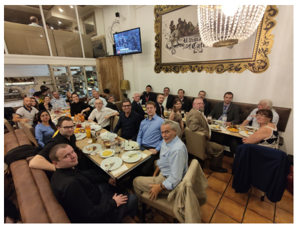
Photo 11. Party at the Conference in Viseu, 2011.

Although the gala dinner had taken place the previous evening, it was also a moment summarizing the social dimension of scientific meeting, including its strong traditional and cultural aspects (e.g., tasting local dishes) and increased integration of the organization's membership [Photo 11].