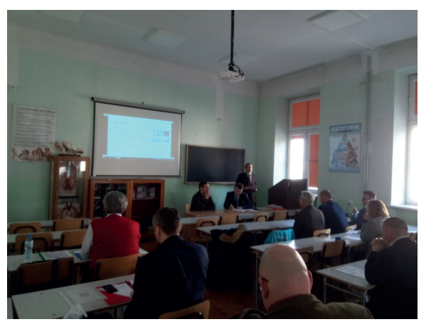
Photo 2. 26<sup>th</sup> General Assembly Commemoration Symposium of IPA, Rzeszow 2019.