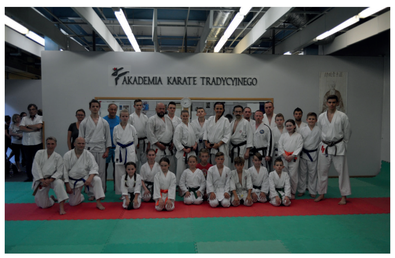
Photo 5. Hapkido and taekwon-do training in the Academia, Rzeszow, June 12, 2019.