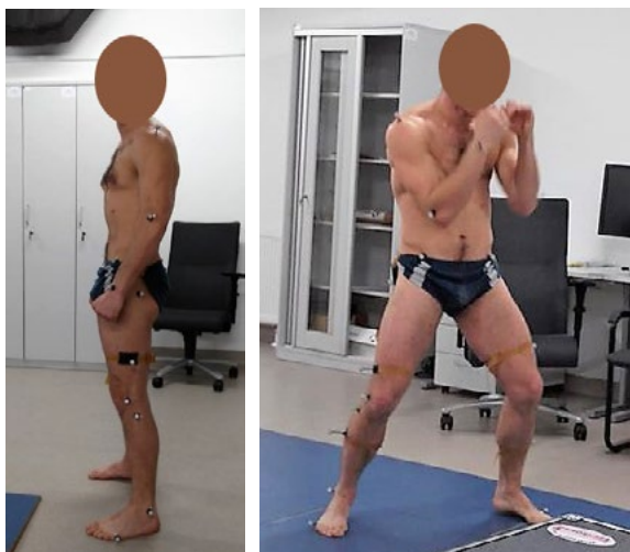
Photo 1. Athlete with markers and during the test

The sequences of front kicks performed in two variants were analyzed in this work. In the first place, the athlete performed a kick without a given target (into the air), then an attempt was made to reach the target. The target of the kick was a small ball hanging still above the ground at the height of 90 cm. The athlete made three attempts to kick without and at the target. The sequences of kicks were recorded using the BTSSMART DX 6000 system of motion complex analysis. The system consisted of six cameras that read the position of 22 markers placed on the athlete's body in real time. Thanks to this, it was possible to register the motion image of the examined body and evaluate the obtained kinematic parameters in relation to the target. The kinematics of selected parts of the lower limb during the kick was analyzed. The analysis used basic statistical parameters (average and standard deviation) and the non-parametric Wilcoxon test.