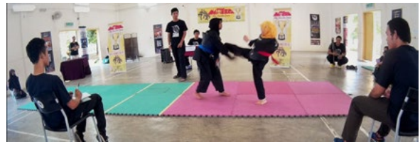
Fig 3: The silat tempur competition in 2017.