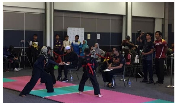
Fig. 4 and 5: The silat tempur competition in 2018.

The points system in silat tempur is similar with silat olahraga [Anuar 1992; Shapie et al. 2008, 2013] with the ability for silat exponents to score maximum points during 3-rounds of a fight is critical to win the silat match. In silat, any legal/ clear points (hit the target) with punch (1 point), kicks (2 points) and topple down (3 points) will help to increase the overall points scored [Anuar, 1992]. Moreover, any clear defensive action followed by legal/clear point will be awarded an extra point (i.e. 1+2 points for any successful block or dodge followed by successful kick to the body-target) [Shapie 2011]. As the agenda of silat is to differentiate between silat competition and other sports combat competition (e.g. taekwondo, karate, kick boxing), it is important for every coach and silat exponent to understand the mechanism of scoring points of silat competition. Besides, it also aims to display the high quality of silat competition. Thus the understanding of the silat scoring points is very important especially in helping coaches to determine which attack and defensive movements that can give more benefits and chances to their exponent to win in competition. The point for attacking and defensive movement will be given as below: