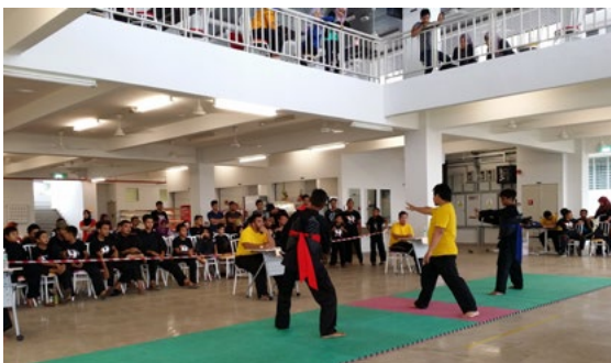
Fig. 2: The silat tempur competition in 2014.