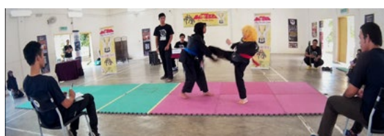
Fig. 6 and 7: The movements in silat tempur competition.

The silat step patterns are something that makes silat different from other martial arts [Shapie et al. 2018c]. Every movement in a silat contest must be in silat posture (Figure 6 and 7). It should not be similar like jumping in