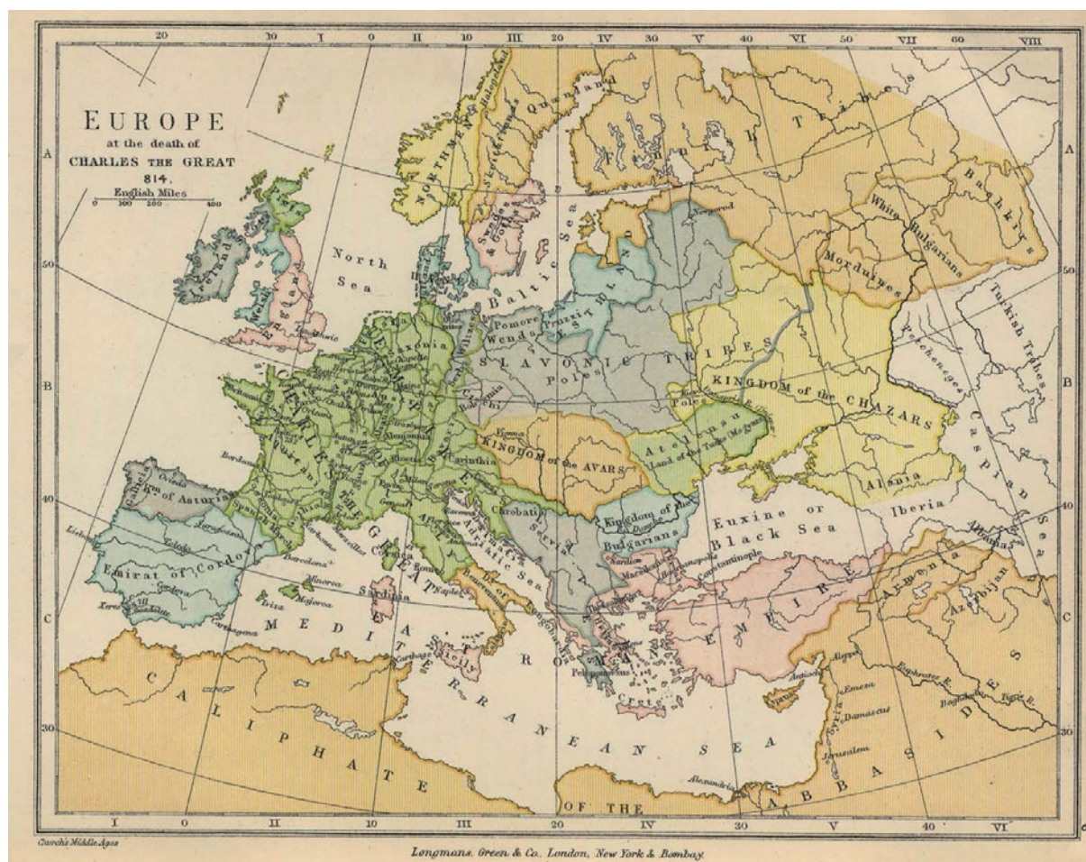
Fig. 2. Map of Europe, 814 AD [Longmans, Green & Co., London, New York & Bombay].

he states that Lithuanians and Yotvingians come from the Pechenegs and Cumans (Polovtsi) (ibidem, vol. 1, book 5, chapter 5). In turn, according to Master Wincenty Kadlubek the Cumans descended from Parthians 7 [Wincenty 1208, book 2, ch. 25: 94].