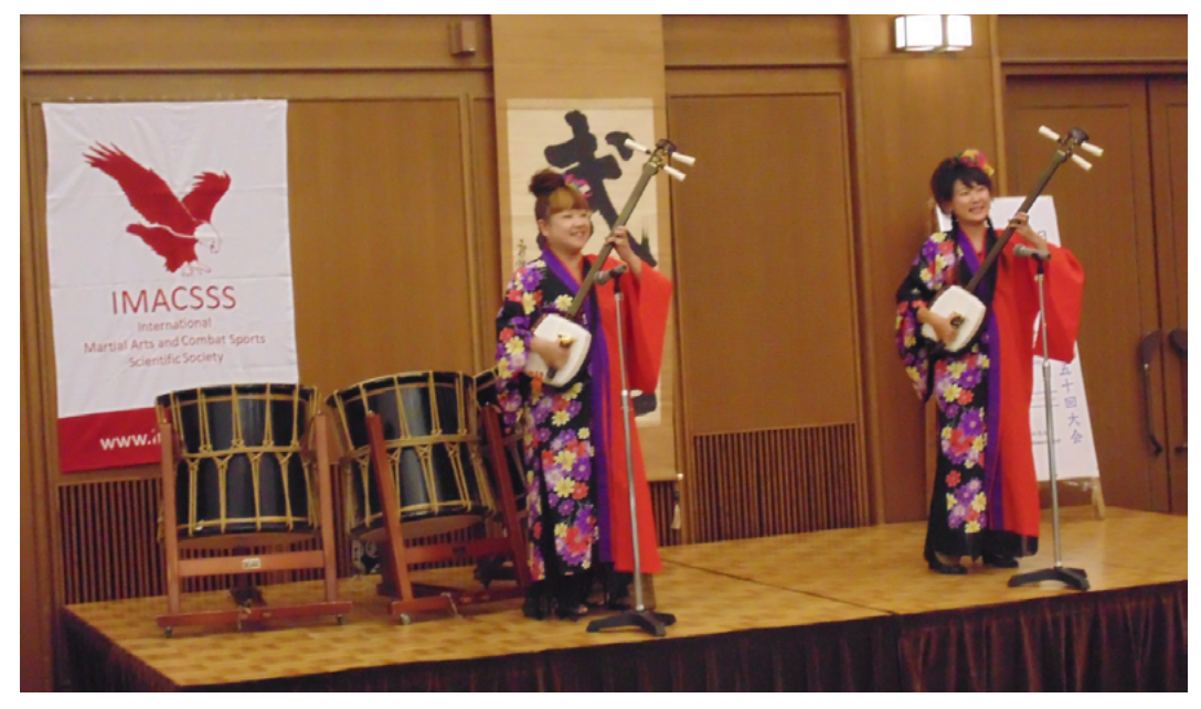
Photo 2. Concert of traditional Japanese music and singing during the reception, Kansai University, Osaka 2017.