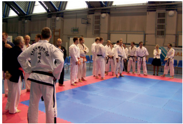
Photo 1. The beginning of workshops at the Congress.

Similarly as in 2006, at the invitation of the organizers renowned specialists arrived – scholars and practitioners, dealing with broadly understood – both in the olympic sports domains (wrestling, boxing, fencing, jūdō , taekwondo ) and the sports and martial arts less known although having a significant