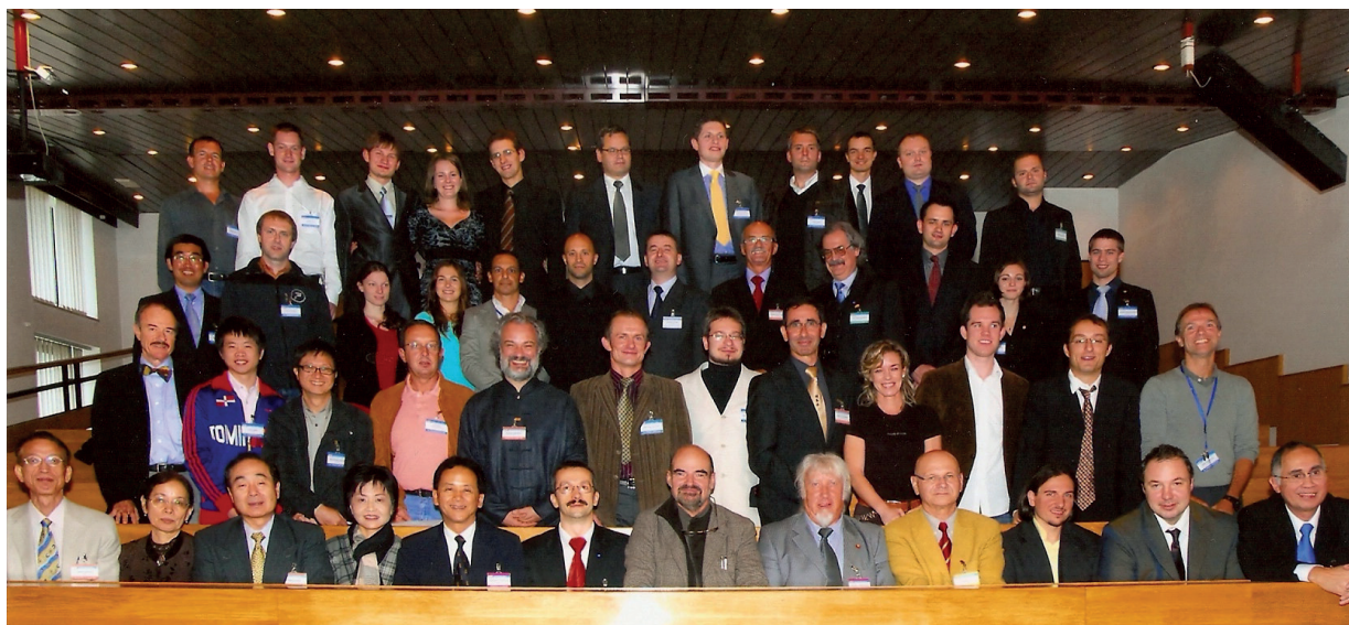
Photo 3. The participants of the first plenary session of the Congress IMACSSS, Rzeszow, 17 September 2010.