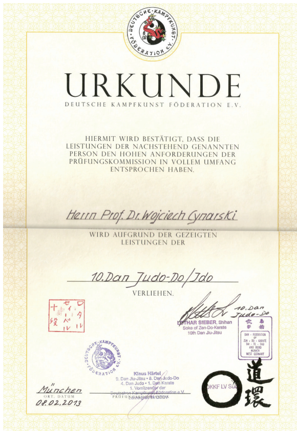
Fig. 3. Certificate for shihan Cynarski, signed by meijin Sieber 10 dan and shihan Härtel 9 dan.