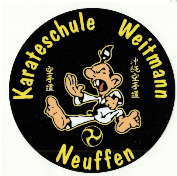
Fig. 2. Logo of Karate School in Neuffen

From 3 to 9 February 2013 the International Scientific and Methodological Seminar of DDBV 8 and IPA on the "Philosophical basis of zendo karate and its practical application" was held in Germany. This event essentially took place at the Sports School "Jiu-Jitsu Karate Schule L. Sieber" (JJKSS) in Munich, and in addition, at the "Karateschule H. Weitmann" in Neuffen (figure 2). This event was a joint enterprise by the above-mentioned associations and by private schools, and the implementation of international research programmes carried out by the Faculty of Physical Education UR (as WWF/PB/5. Institutionalization of Far-Eastern martial arts in Europe – international comparative research ) and research project IPA 2: Interdisciplinary, multi-faceted study of the phenomenon of martial arts (October 2010 – October 2013). It was designed to establish further cooperation within the IPA, EJKC and IMACSSS – the International Martial Arts and Combat Sports Scientific Society.