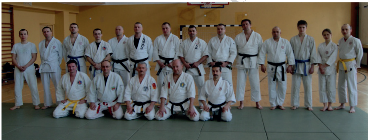
Photo 6. Participants in the Workshops