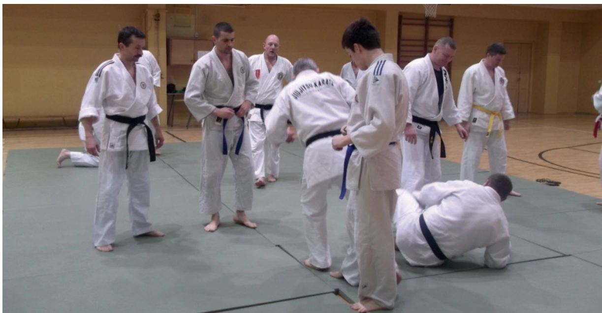
Photo 5. During the 3 rd Workshops in Rzeszów

This copy for personal use only – distribution prohibited — This copy for personal use only – distribution prohibited