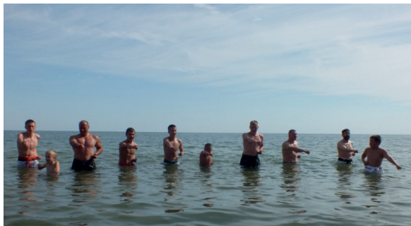
Photo 4. A group of budōka during the 20 th IPA's Summer Camp [IPA]

Ten people passed their tests for higher degrees ( kyū and dan ). The next step of the IPA during 20 th Anniversary will be the 3rd Symposium, with papers and workshops, in Rzeszów – in March 2013.