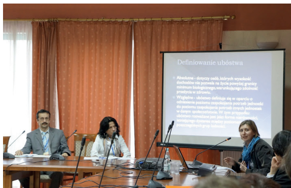
Photo 6. During the conference in Poznan, Oct. 2012.