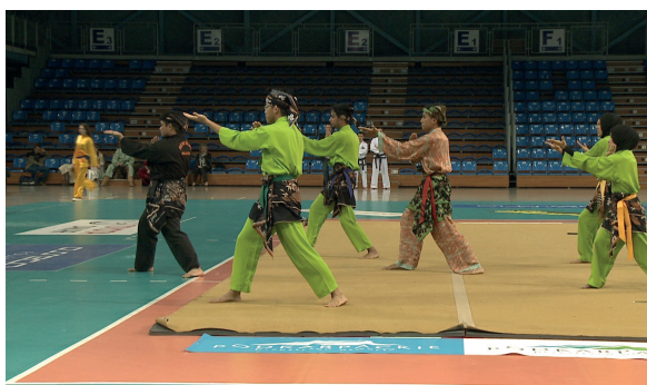
Photo 10. Malaysian silat