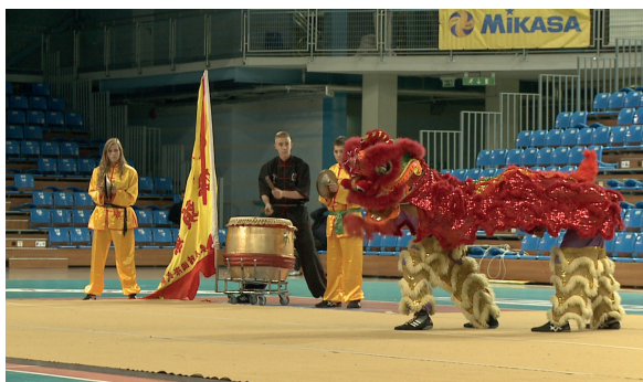
Photo 9. Chinese dragon dance