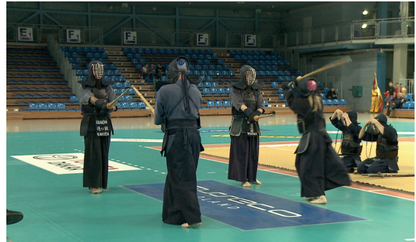
Photo 6. Kendo demonstration