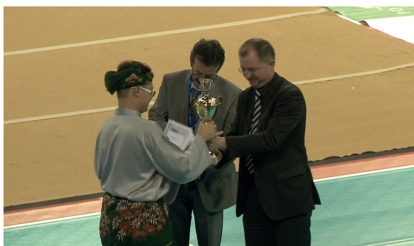
Photo 14. Presenting cups and diplomas

mative ethics of European knights and comparison to other canons of ethics.