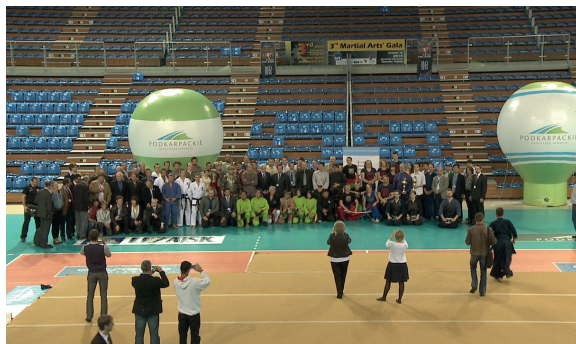
Photo 15. Participants of the Gala