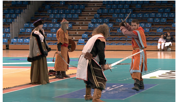
European historical fencing